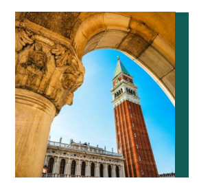
Best of Italy |13 Days |2 Countries Rome, Florence and more

Save on 2025 value tours with one-of-a-kind experiences like Stays with Stories, authentic local Be My Guest Experiences and must-see icons included. Book by February 20, 2025 to lock in your savings and preferred travel dates.