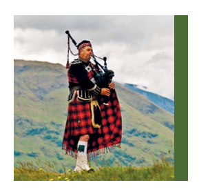
Best of Ireland and Scotland | 15 Days | 3 Countries Dublin, Edinburgh and more