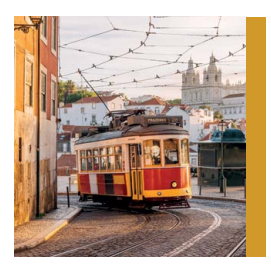
Treasures of Spain and Portugal |14 Days |2 Countries