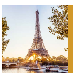
Paris Explorer | 8 Days | 1 Country Paris, Versailles and more