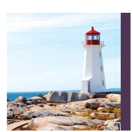
Enchanting Canadian Maritimes | 9 Days | 1 County Cape Breton Island, Wood Islands and more

For more information or to book, contact your Travel Advisor.