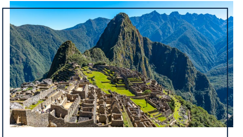
Peru with Machu Picchu

Travel through the best of Portugal's cities and countryside on this 11-Day tour