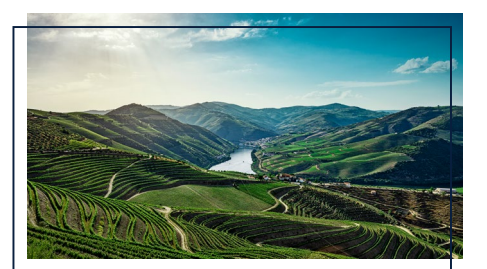
Country Roads of Portugal

Travel through the best of Portugal's cities and countryside on this 11-Day tour