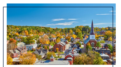
New England's Fall Foliage Celebrate the beauty and bounty of New England on this 8-Day

Experience the Inca heritage and ancient archaeology of Peru on a 10-Day tour